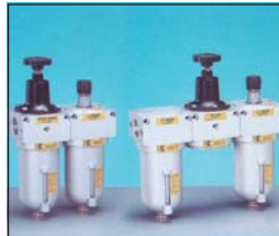
COMPRESSED AIR UNITS 5063

COMPRESSED AIR UNITS Material aluminium Ports in body from 3/4" to 1"