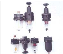
COMPRESSED AIR UNITS 5062

COMPRESSED AIR UNITS Material aluminium Ports in body from 1/4" to 3/4"