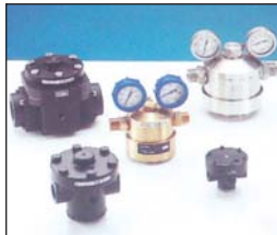
REGULATORS WITH REMOTE CONTROL 5065

REGULATORS WITH REMOTE CONTROL Material aluminium, brass, bronze, stainless steel AISI 316 Ports in body from 1/8" to 4" Pressure range from 0.5 - 50 BAR