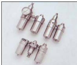
COMPRESSED AIR UNITS STAINLESS STEEL AISI 316 5068

REGULATORS STAINLESS STEEL AISI 316 MADE Ports in body from 1/4" to 2" Working pressure from 0.5 to 50 BAR