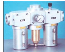
COMPRESSED AIR UNITS 5064

COMPRESSED AIR UNITS Material aluminium Ports in body from 1-1/2" to 2"