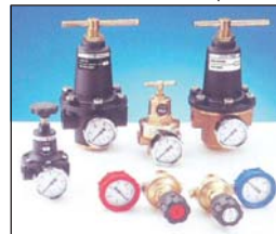
REGULATORS WORKING PRESSURE 50 BAR 5069

PRESSURE REGULATORS MADE IN STAINLESS STEEL AISI 316 Max pression 220 BAR max flow 5000 Nm 3 /h