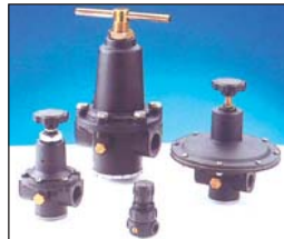
HIGH SENSIBILITY REGULATORS 5066

HIGH SENSIBILITY REGULATORS Material aluminium, brass, bronze, stainless steel AISI 316 Ports in body from 1/8" to 4" Pressure range from 200 mm H 2 O to 2 BAR