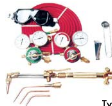
Type 23 AS00152