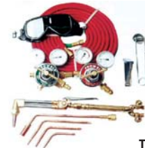
Type 21 AS00153