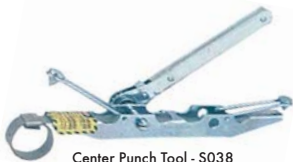
Center Punch Tool - S038 AR00044

These ratchet action tensioning tools are for applying Center Punch and Center punch lock.