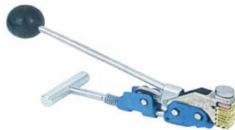
Center Punch Tool - T300 AR00040