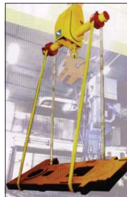
Pal Turn Atilting system from 1 to 20 t WLL which is suitable for handling and tilting heavy or bulky loads in full safety. • Patent pending