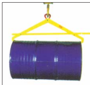
HF Semi-automatic drums clamp for horizontal lifting