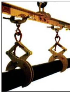
RT Round bars and Pipes clamps