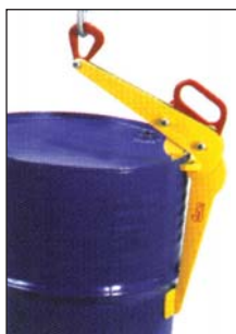
VLF Drums clamp for vertical lifting