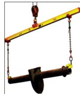
Pal Beam Standart single beam for lifting of various loads Customized from 1 to 4 meters W.L.L. from 1 to 5 tonnes