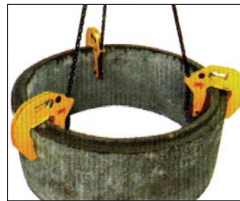
RB Manholes hooks Automatic adjustment-Use only by 3