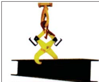
PL Girders clamp