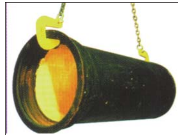
F Pipes hooks. Use in pair