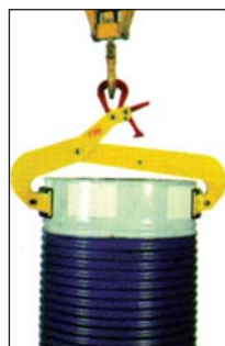
VFR Semi-automatic drums clamp for vertical lifting