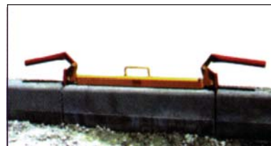
BX Kerbstone clamp