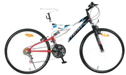
AM00494 Mountain Bicycle