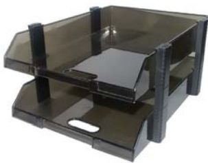
AM00517 2 Tier Tray