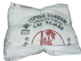
AM00469 Flour Bag