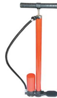
AM00505 Bicycle Pump