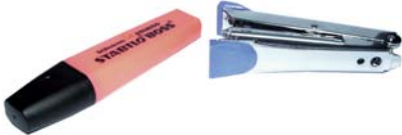
AM00519 Stabilo Hi-Lighter