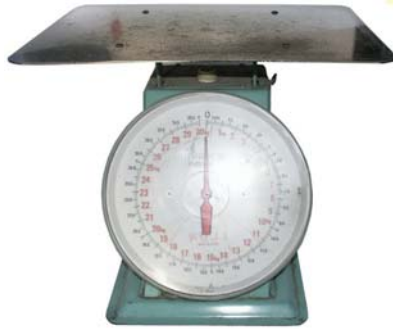
Weighing Scale AM00524 Size 10kg AM00525 Size 50kg