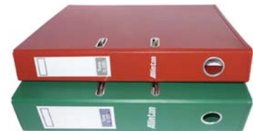
AM00515 2" AM00516 3" Arch File