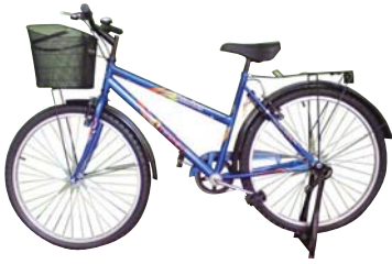
AM00495 26" China Bicycle