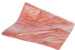
AM00468 Carry Bag