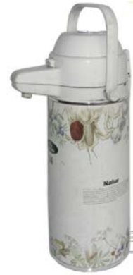
AM00526 Air Pot