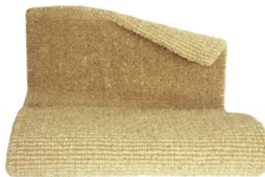
Floor Mat AM00483 Size 24 x 36 AM00484 Size 30 x 48