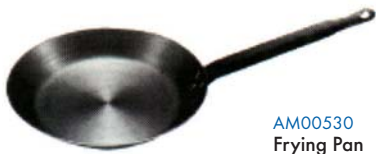
AM00530 Frying Pan