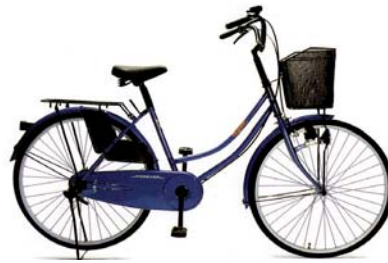
AM00612 Lady Bicycle