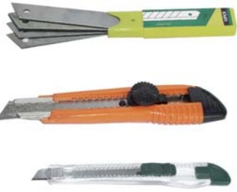
NT Cutter AM00540 Small AM00541 Large AM00542 Blade Large AM00543 Blade Small