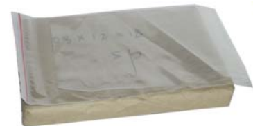
Plastic Bag AM00477 Size 4" x 6" AM00478 Size 6" x 9" AM00479 Size 9" x 12" AM00480 Size 12" x 24" AM00481 Size 24" x 36"