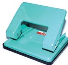
AM00514 Two Hole Puncher