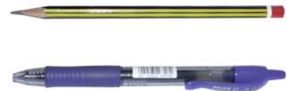
AM00521 2B Pencil