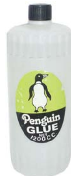
AM00518 Stationary Glue