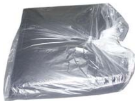
Rubbish Bag AM00466 Size 30" x 34" AM00467 Size 36" x 48"