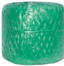
Raffia String AM00506 Small (1 lb) AM00507 Large (4 lb)