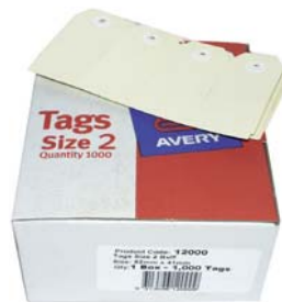
Paper Tag AM00508 Size #1 AM00509 Size #2 AM00562 Size #3 AM00563 Size #4