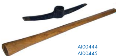
Pick Axe & Handle