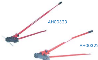
Bar Bending & Cutting Machine