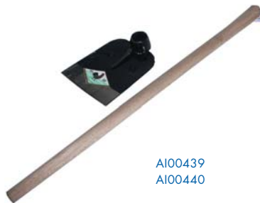
Changkol w/o Handle