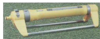
2976 AI00902 Lawn Queen Duo 16- (15 hole spray bar) 2977 AI00903 Lawn Queen Duo 20- (17 hole spray bar)