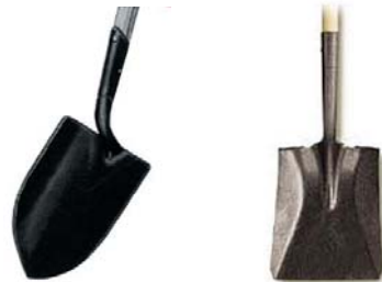
Shovel Round & Shovel Square