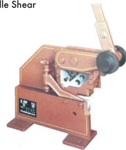
Long Handle Shear