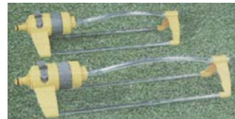
2972 AI00900 Lawn Queen 15- (15 hole spray bar) 2974 AI00901 Lawn Queen 17- (17 hole spray bar)