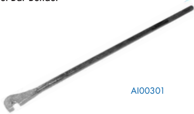
Steel Bar Bender