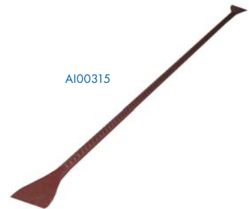
5 ft H.D Scraper