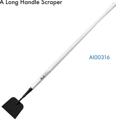
USA Long Handle Scraper