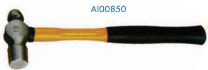
Ball Pein Hammer