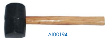
Wooden Handle Rubber Hammer