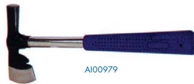
Multi-Purpose Hatchets Hammer