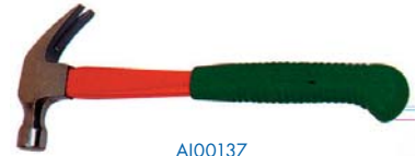
Fiberglass Handle Claw Hammer