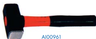
German Type Stoning Hammer