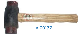
Thorace Rawhide Hammers