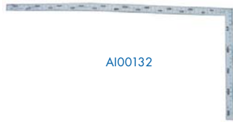
Japan Stainless Steel Square