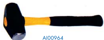
American Type Stoning Hammer