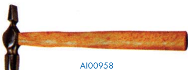
Cross Pein Hammer