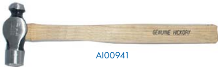
Ball Pein Hammer