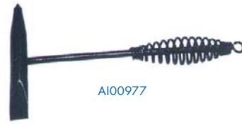
Spring Chipping Hammer