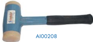
Dead Blow Hammer