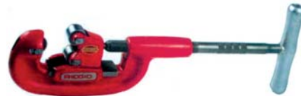
Nos. 1-A & 2-A AH32810

Fast, Clean pipe cutting by hand or power. Extra long shank protects adjustment threads, while an extra-large handle is provided for quick, easy adjustment. Can be converted to 3-wheel cutter by replacing rollers with cutter wheel, or can be ordered as 3-wheel model for use in areas where a complete turn is not possible.