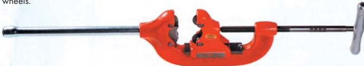
Nos. 44-S AH32880

Designed for work in areas where a complete turn is impossible. No. 42-A has a short handle for use in areas where only a 130° turn can be made. Second handle on No. 44-S makes two-man leverage possible on large pipe sizes. Both equipped with four heavy-duty wheels.