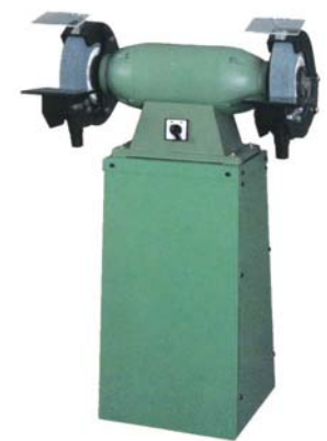
AET 350P 14" AC00977