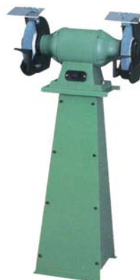
AET 250P 10" AC00975