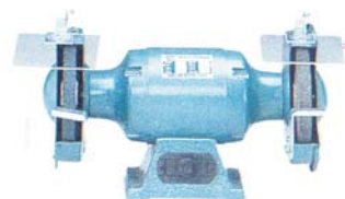
AET 200 6" AC00969 8" AC00970