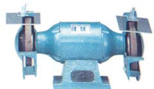
AET 250 10" AC00971 12" AC00972