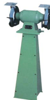
AET 300P 12" AC00976