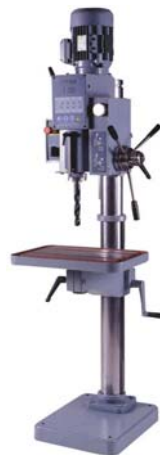
IMA 1-30M AC00965