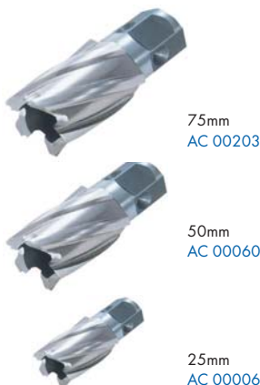
75mm AC 00203